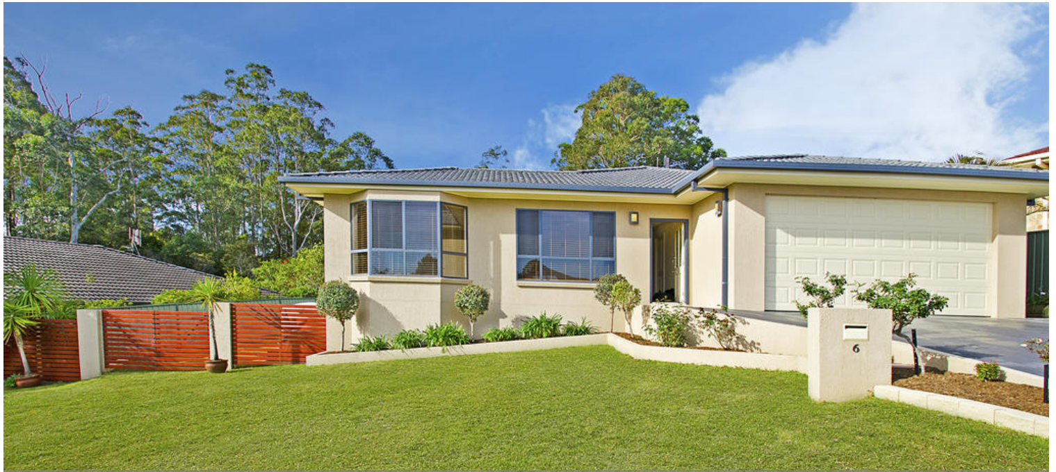
6 Millwood Place, Wauchope