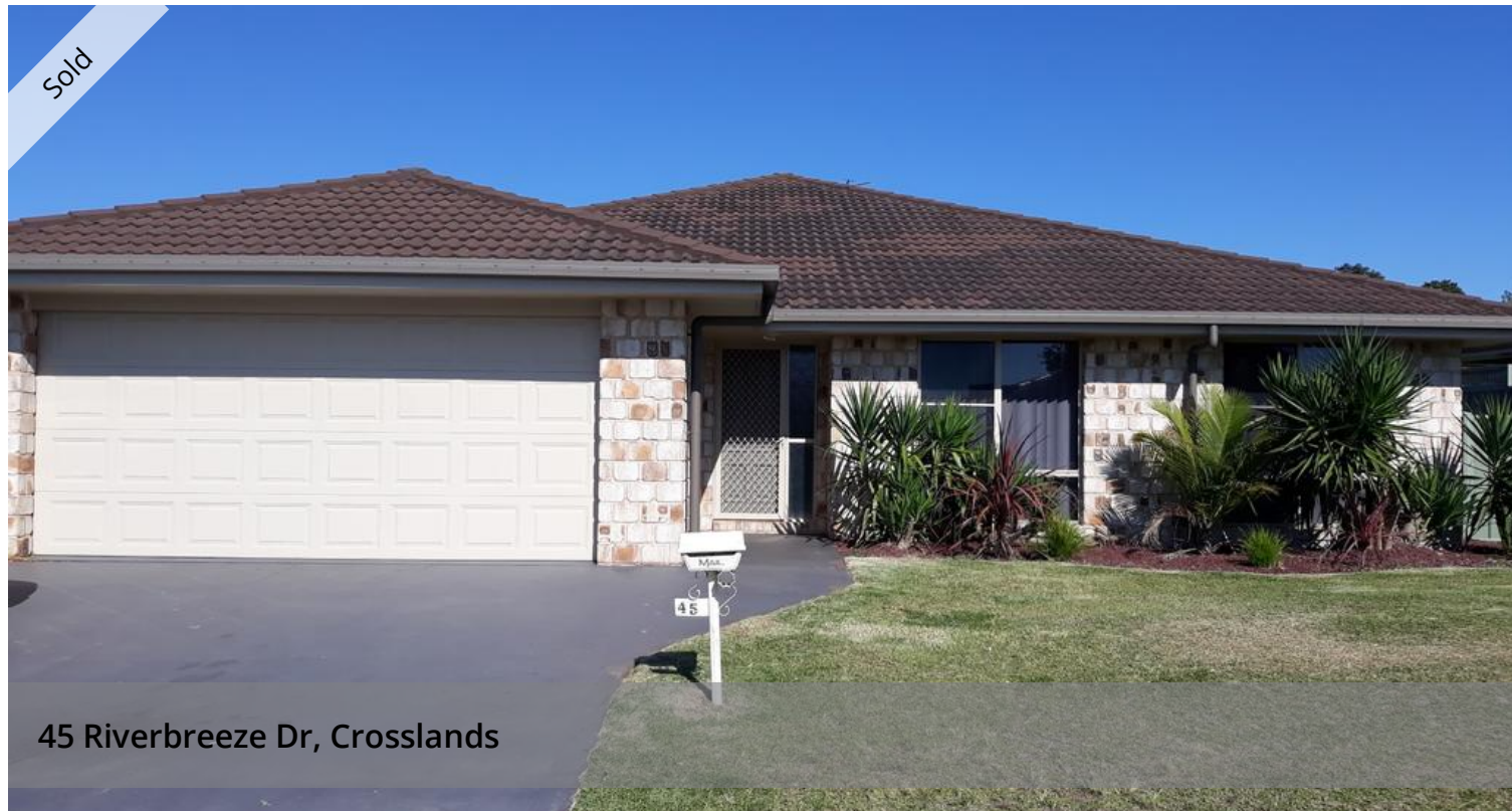
45 Riverbreeze Dr, Crosslands