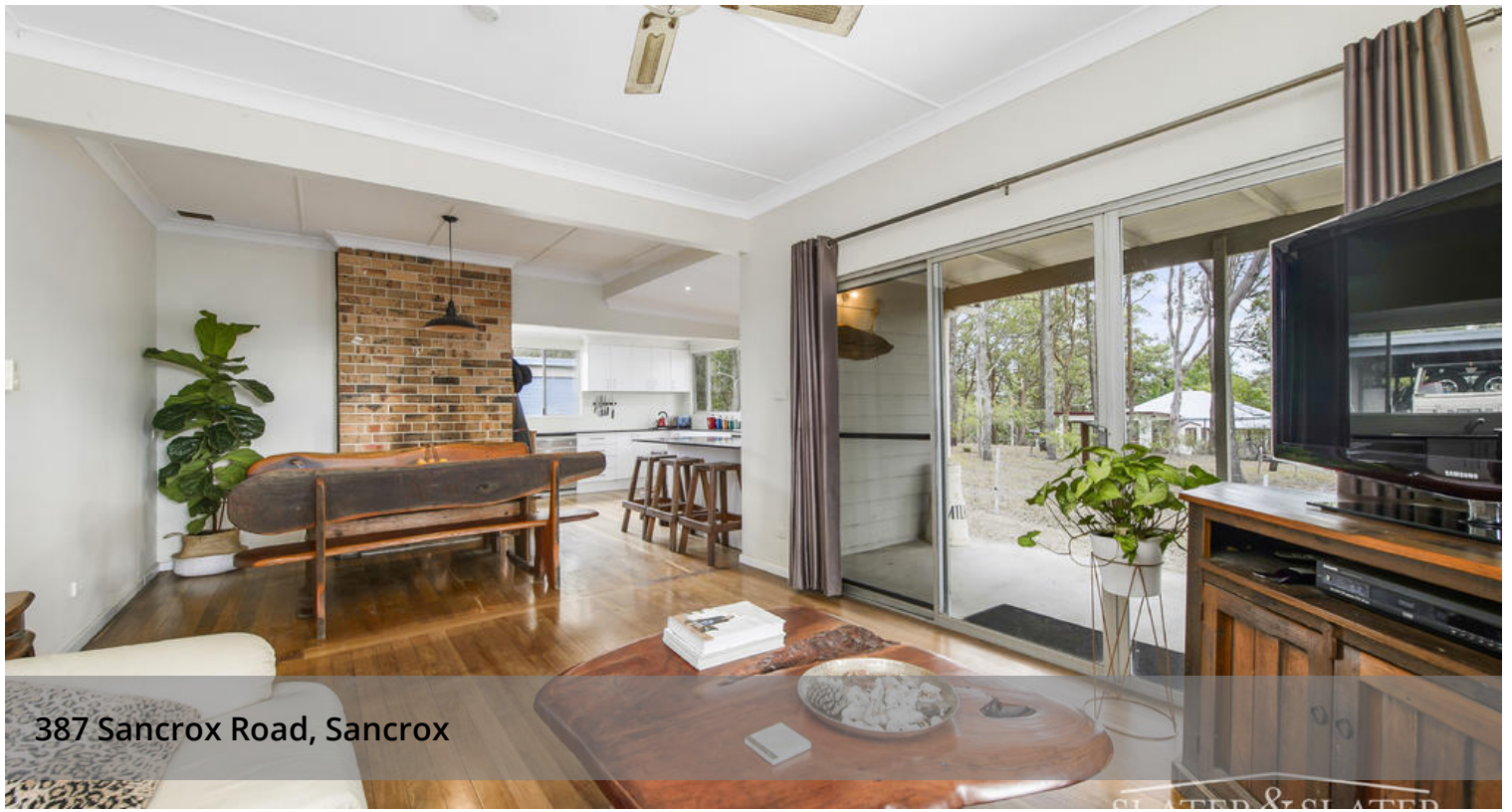
387 Sancrox Road, Sancrox