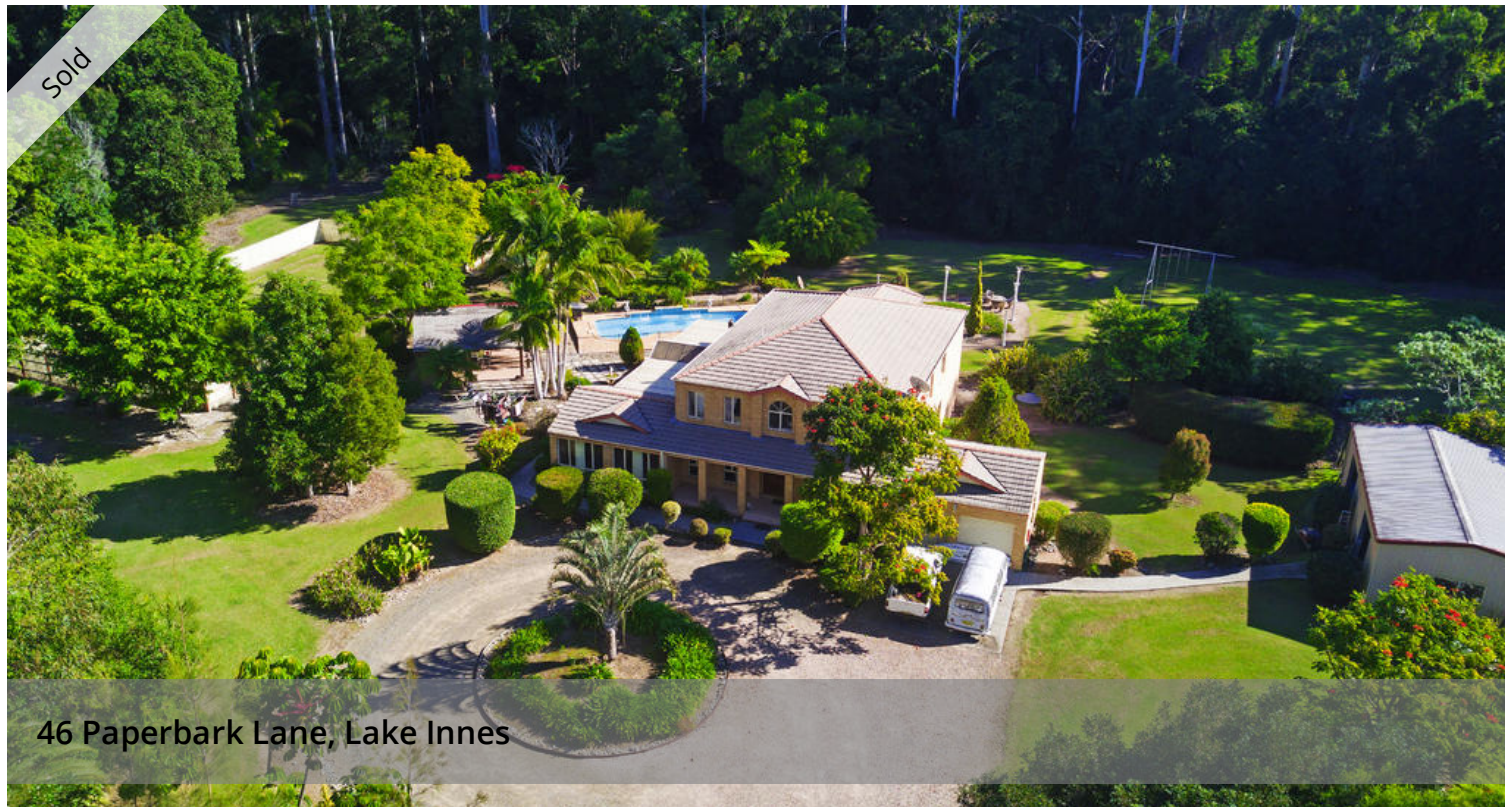
46 Paperbark Lane, Lake Innes